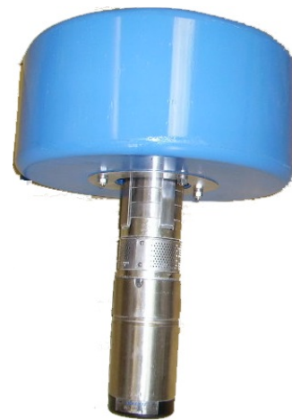
PS150-Centric C-SJ5-8 with float