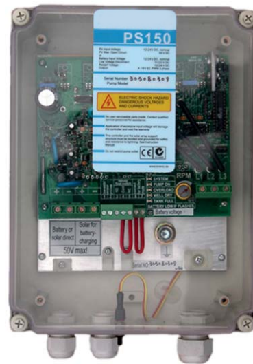
PS150-Centric C-SJ5-8 Controller, Pump and brushless motor

2 year against defects in materials and workmanship